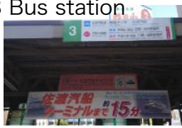
No.3 Bus station

the bus for SADO KISEN FERRY TERMINAL you can see the symbol of the ferry